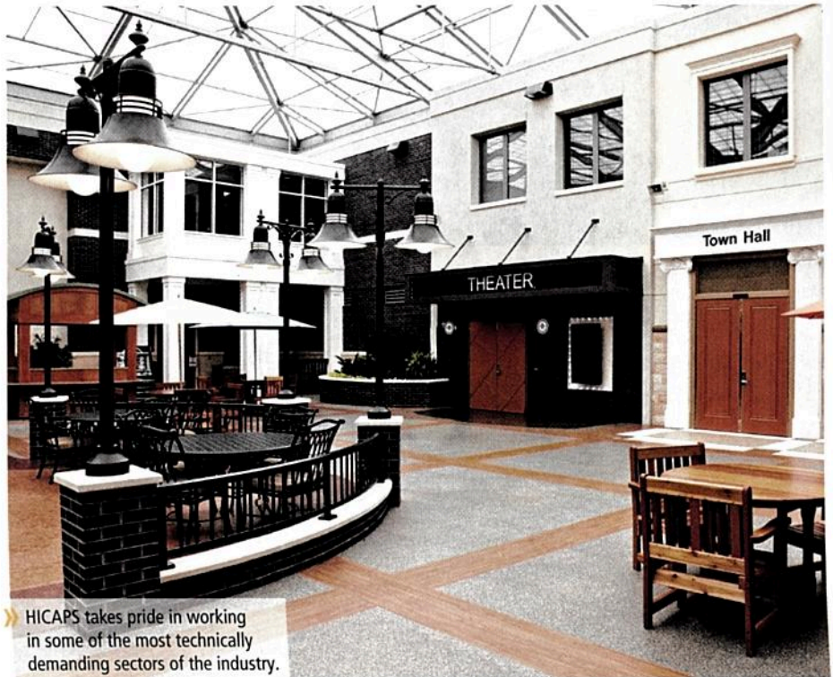
» HICAPS takes pride in working in some of the most technically demanding sectors of the industry.